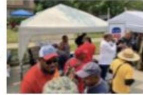
Garfield Days 2023

Recently we had two successful outreach programs, Juneteenth Day and Garfield Days. Volunteers helped work the booth and hand out literature. The success was the public had to opportunity to see us and talk to us, but most importantly we had the opportunity to hear directly from them on their concerns on issues in Milwaukee and the Nation. A huge thank you to all who made these booths possible. Community Outreach is a major focus in order to help move the RPMC forward as a proper political organization.